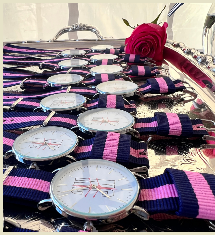
A display of complimentary watches sits atop a silver tray adorned with roses at the corners. The watches were handed out as gifts to the VIPs in attendance, many of whom helped sponsor the event.

"Another is the opportunity to show folks from out of town or out of state just what it is we all know and appreciate -- that High Point has a lot to offer in the way of beauty and amenities which makes this city and the surrounding Triad an ideal destination for future events, tournaments and even permanent relocation of residences and businesses."